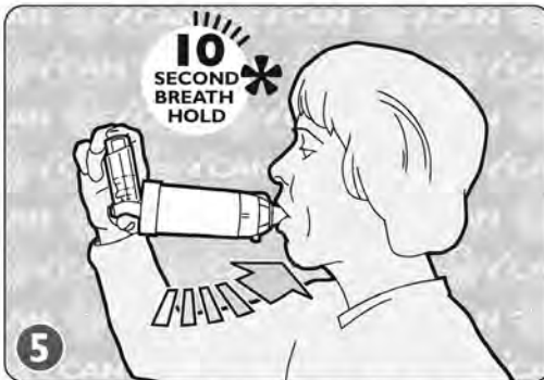
SLOW DEEP BREATH IN & HOLD