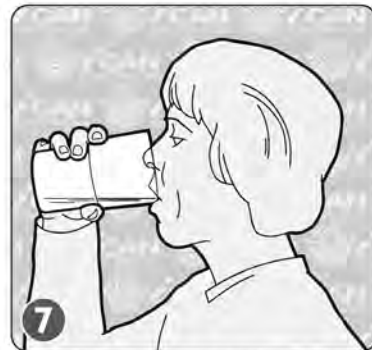
DRINK OR BRUSH TEETH