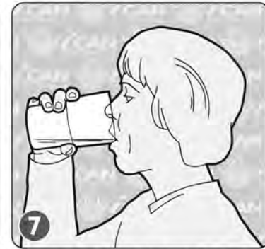
DRINK OR BRUSH TEETH