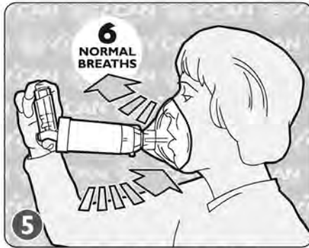
BREATHE IN & OUT